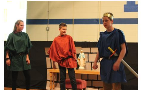
7 th Grade Presents Hamlet