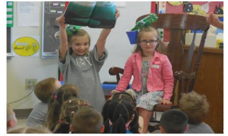
Principals for the Day!