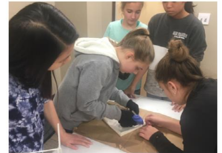
Team attending a skills workshop.