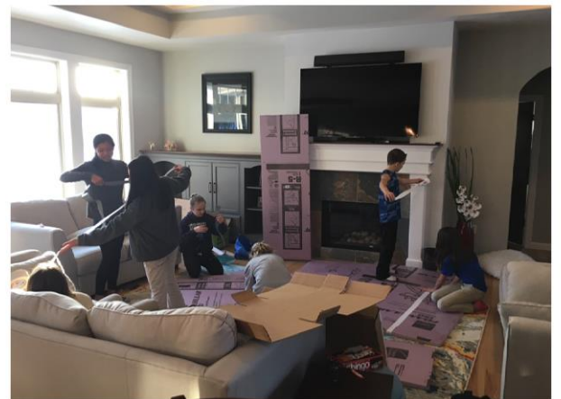
Working on scenery.